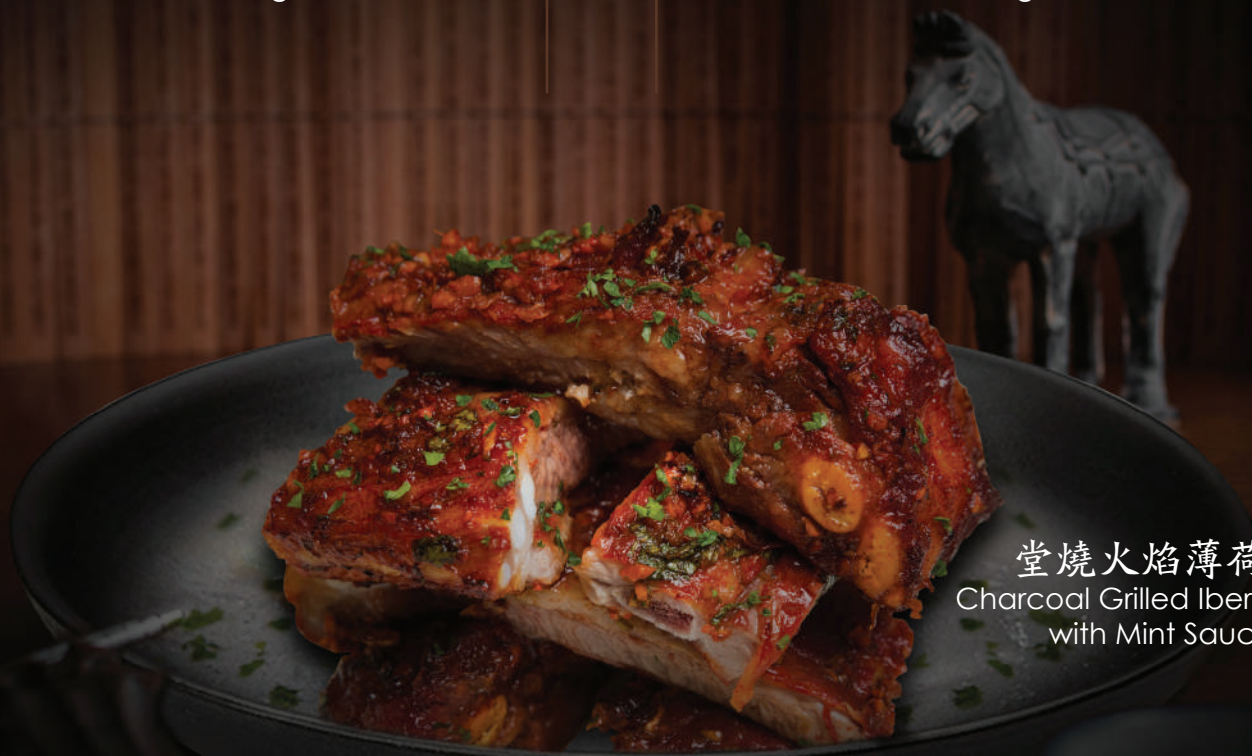
堂燒火焰薄荷骨 Charcoal Grilled Iberico Ribs with Mint Sauce